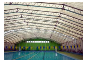
Swimming pool at Usui-Minami Junior High school