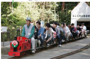
Take a fun-ride on a mini steam locomotive

Enjoy 'just about everything' during summer vacation with your family and friends at Kusabue-no-oka!