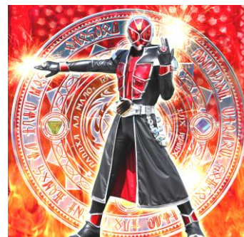
Kamen Rider Wizard

Admission to Kusabue-no-oka : Children up to junior high school age: ¥300 Younger children: ¥150 Others: ¥400