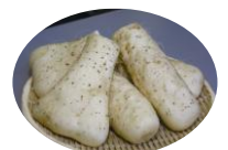
Japanese yams will be offered to the first 500 attendees!