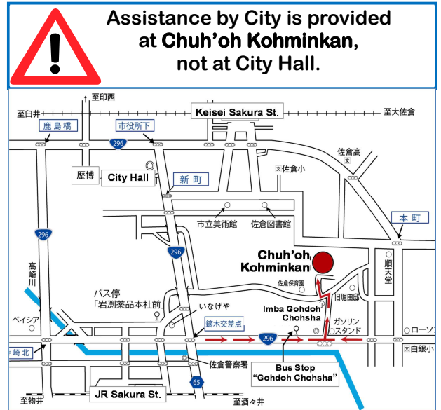
Map of Chuh'oh Kohminkan

http://www.nta.go.jp/tetsuzuki/shinkoku/shotoku/tebiki2014/pdf/43.pdf