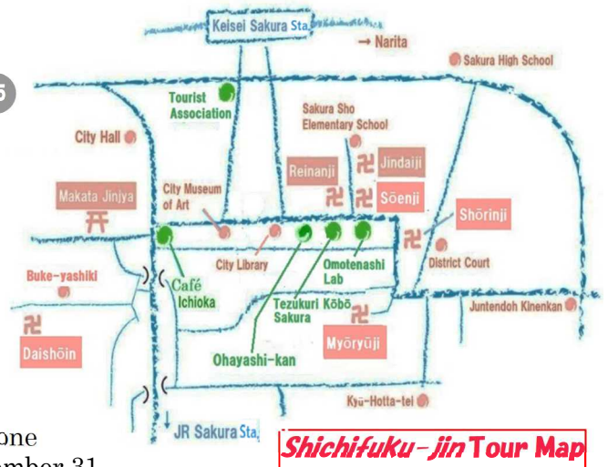
Shichifuku-jin Tour Map

Application, with the applicant's name, address and phone number written, must be sent by fax no later than December 31.