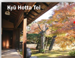
Kyū Hotta Tei

An ancient path surrounded by beautiful bamboos. The slope has been unchanged since the Edo Period (1603~1867) and is called the "Old Path of the Samurai".