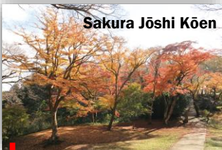
Sakura Jōshi Kōen

A historical park with lots of greenery and ancient trees. Located inside the Sakura Castle ruins, where remains of the castle and the empty moat are still seen in the park.