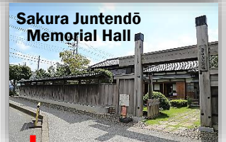
Sakura Juntendō Memorial Hall

One of the largest samurai residences in the Kantō region, facing a hedge of earthen mounds that still retain the appearance of a castle town.