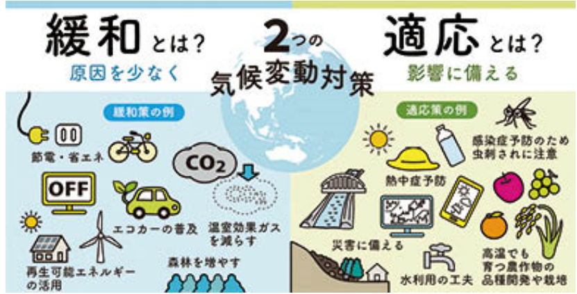
Examples of Mitigation Measures

Mitigation , which involves reducing emissions of greenhouse gases that cause climate change.