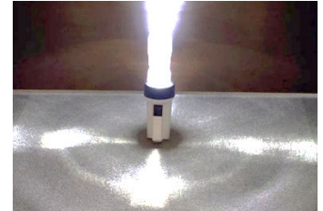
Flashlight with a plastic PET bottle on top