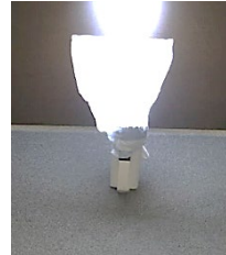
Flashlight w/plastic bag