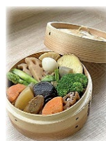
▲ "Okowa" September Menu

The City Hall cafeteria, which specializes in locally grown rice and vegetables, will be offering the "Tsuda Sen Menu", named after the father of Tsuda Umeko, a Sakura native who popularized Western vegetables throughout the country. This will be a short time offer and with limited quantities, so please stop by the next time you visit the City Hall. We recommend you make a reservation in advance by phone, etc. as the number of tickets is limited per day.