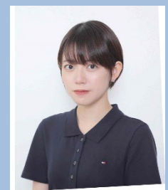
Odaka Sakiko Shogi Player