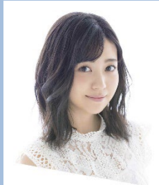
Kumagai Iroha Actress