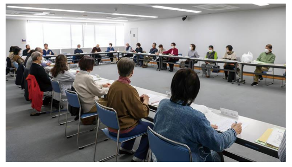
We also hold monthly meetings where we exchange information with colleagues.