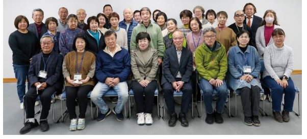
Welfare Commissioners and Child Welfare Commissioners (Usui District)

Inquiries: Shakai Fukushi-ka (Social Welfare Section) 484-6135