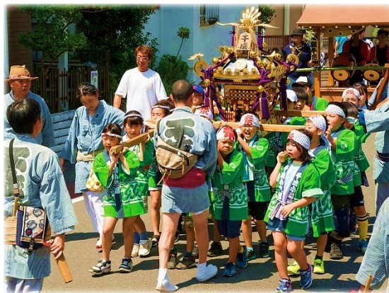
Sennari Neighborhood Association Summer Festival

Inquiries: Jichi Jinken Suishin-ka (Community Affairs/ Human Rights Section) ☎ 484-6127