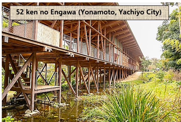
52 ken no Engawa (Yonamoto, Yachiyo City)